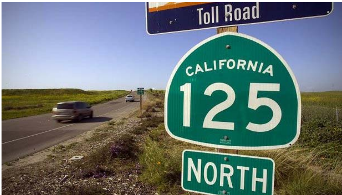
Motorist travel northbound on the South Bay Expressway Toll Road, also known as state Route 125. The company that built and operates San Diego County's lone private toll road filed for Chapter 11 bankruptcy protection in March 2010.